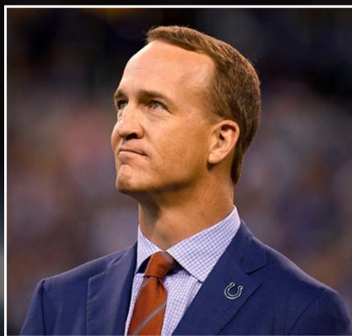
Special Guest PEYTON MANNING

Legendary quarterback Peyton Manning, the NFL's only five-time Most Valuable Player and a 14-time Pro Bowl selection, has earned his place among the greatest quarterbacks in league history as one of the leaders in nearly every statistical passing category. Manning was selected for induction into the Pro Football Hall of Fame's Class of 2021.