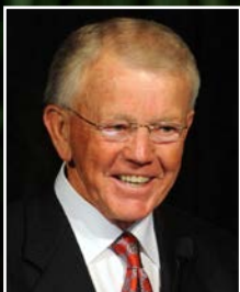
Joe Gibbs , Host Founder and Chairman, Youth For Tomorrow