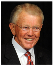
Joe Gibbs , Host Founder and Chairman, Youth For Tomorrow

WITH SPECIAL GUESTS Super Bowl Winning Quarterbacks, Joe Theismann, Doug Williams and Mark Rypien